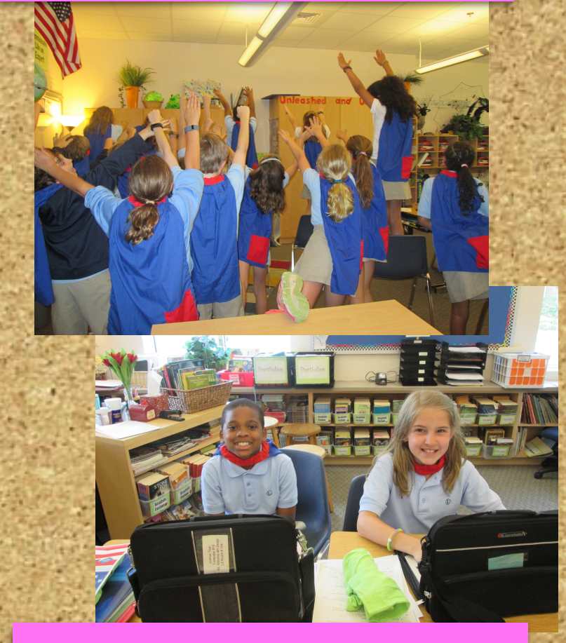
The "Hero" dolls should be completed and at school on Wednesday for their presentation!

This is what real writers do when they are trying to capture the essence of their story. Do you see how super heroes write when they are not soaring?